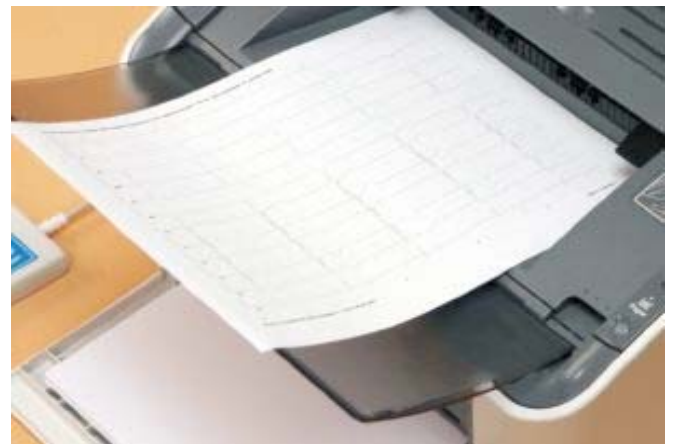
High Quality Report Printout

TeleEMG, LLC - 65 Arlington Road, Woburn, MA 01801, USA Toll Free: 1-877-TeleEMG - Fax: 1-781-937-3081 - Email: info@TeleEMG.com